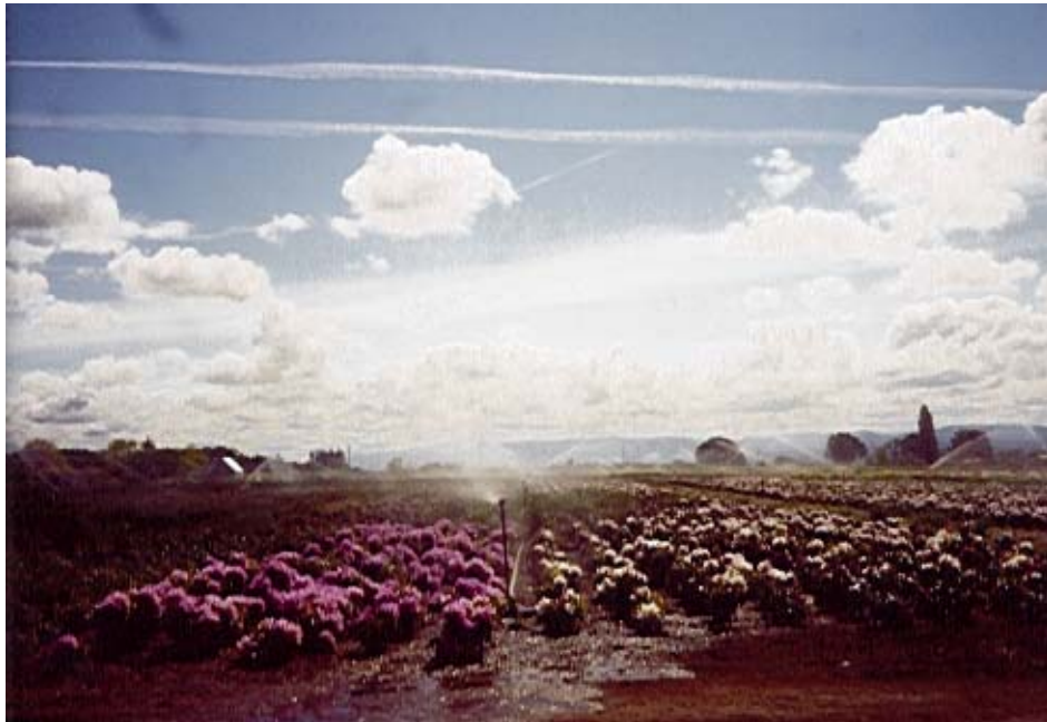
Figure 20 The Agricultural Legacy of Woodburn

A number of observers in Woodburn believe it to be on the verge of major growth, primarily because of the livability of the area and its proximity to Portland and Salem. Growth has been rapid the last few years. The Hispanic population continues to grow, although it has slowed due to job saturation in their labor niches. The primary settlement presently is from urban professionals moving to the new developments on the outskirts of town and commuting to either Portland or Salem for work.